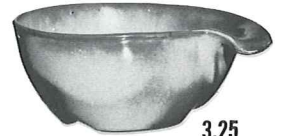
3.25 *4X—14 OZ. CEREAL