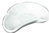
*243—6½" CRESCENT SALAD 2.50