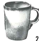
2.75 *5CC—5 OZ. TEACUP