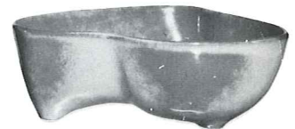
*4N—24 OZ. VEGETABLE 4.75