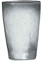
*5L—12 OZ. TUMBLER 3.75