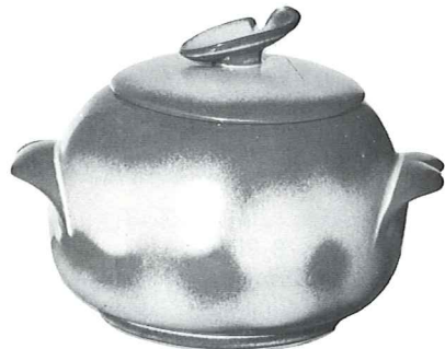
13.25 *4W—3 QT. BAKER/BEAN POT 20.50 *4W/W—BAKER/W WARMER SET