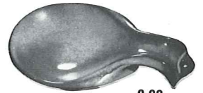
3.00 *4Y—6" SPOON HOLDER