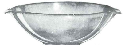
4.75 *201—9" BOWL