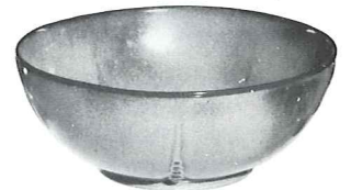
*224—8" ROUND BOWL 6.50