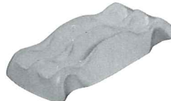
249 TACO HOLDER BOXED 2 PER BOX 10.00 Not Available in Flame