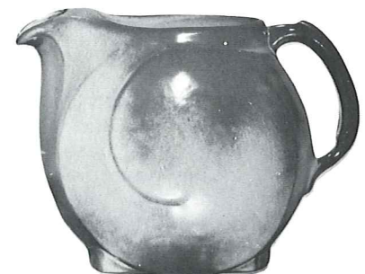
*4D—2 QT. PITCHER 9.25

THIS PAGE AVAILABLE IN PRAIRIE GREEN, DESERT GOLD, BROWN SATIN AND ROBIN EGG BLUE, EXCEPT WHERE NOTED*