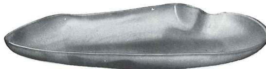
*4P—13" PLATTER 7.75