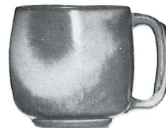
*4M—18 OZ. MUG 4.50