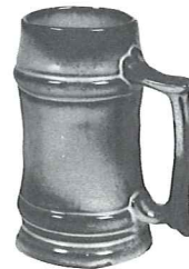
*M2—18 OZ. STEIN 4.50