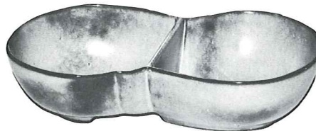
*4QD—11" DIVIDED BOWL 7.75