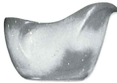
4A—8 OZ. CREAMER 3.25