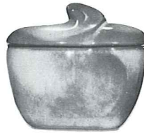
4B—SUGAR WITH LID 5.00